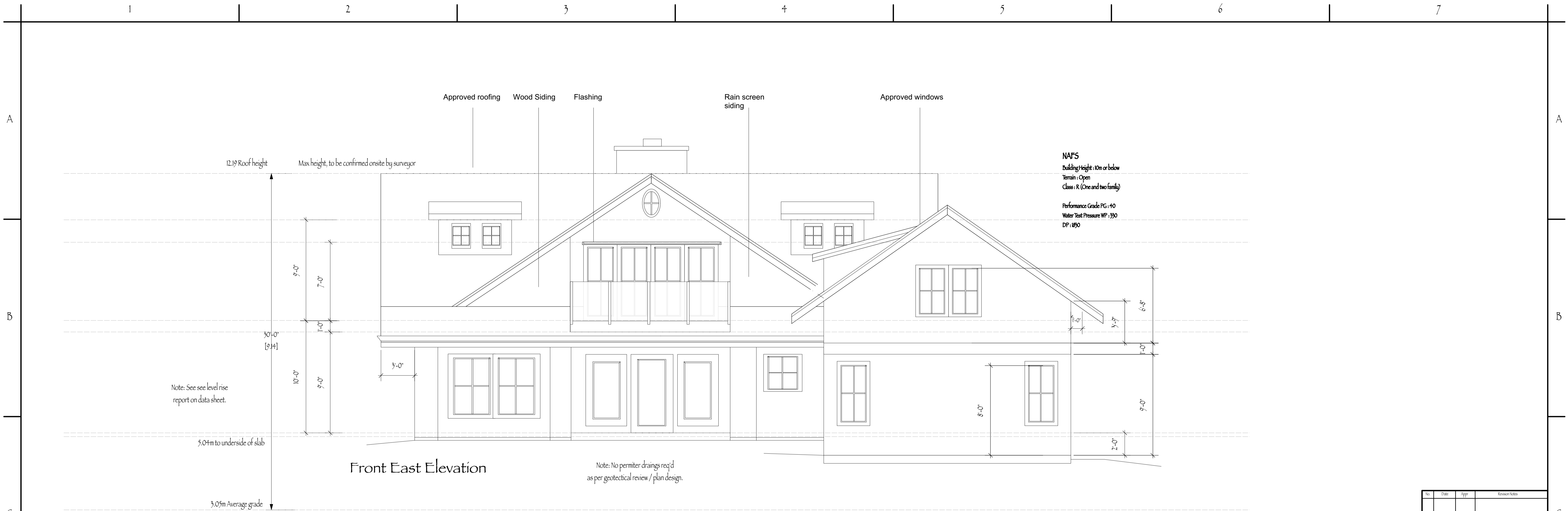
Front East Elevation

Note: No perimeter drainings req'd as per geotechnical review / plan design.