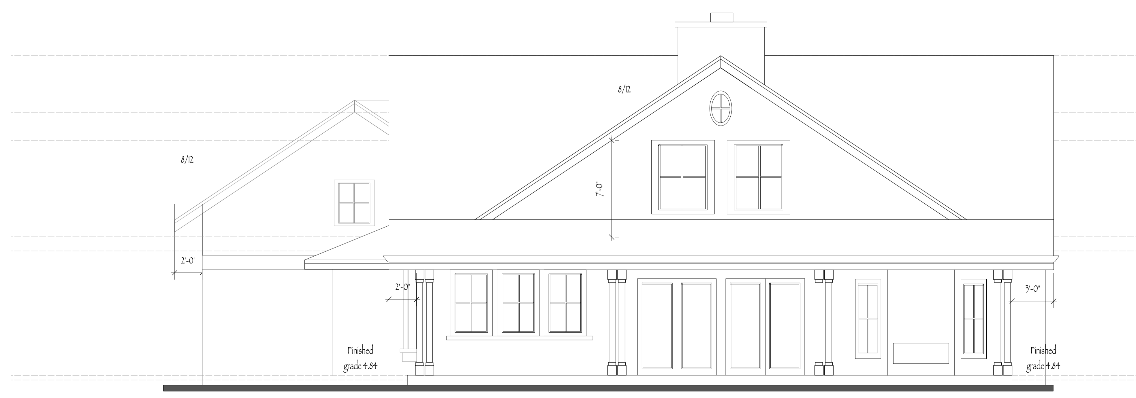
Rear West Elevation